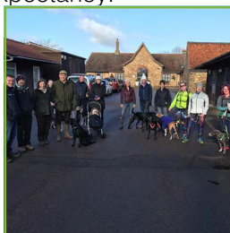
5km for Flu raising awareness of Equine influenza