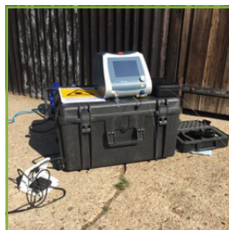
Surgical Diode Lasers are portable, effective and safe.