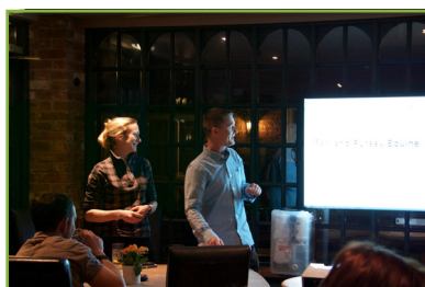
Client Evenings are held at The Greyhound Pub in Aldbury.

We would like to thank everyone that attended last month's dental talk. We hope you all enjoyed the evening and found it worthwhile. Please keep an eye out for future talks.