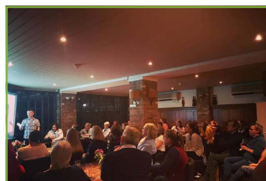
Client Evenings are held at The Greyhound Pub in Aldbury.

We would like to thank everyone who attended last month's talk. We hope you all enjoyed the evening and found it worthwhile. Please contact us if there is a topic you would like to see discussed at future talks and keep an eye out for more upcoming events.