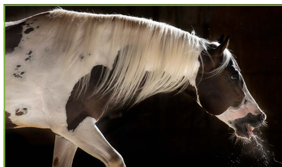
5K for Flu- Farr and Pursey Client event

Look out for further information on our Facebook page, contact the office on 01442 851921 or email us at admin@farrandpursey.com.