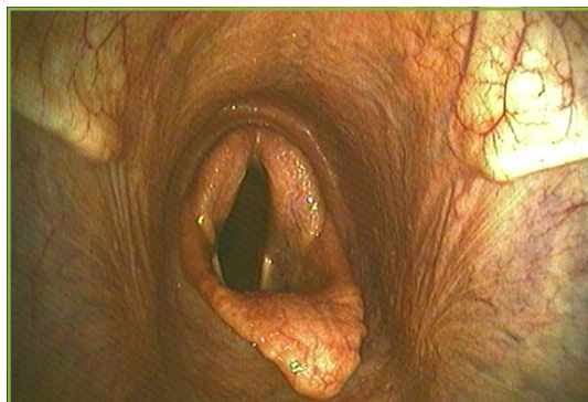
DV3 Airway Images from both tracheal wash & guttural pouch procedures.